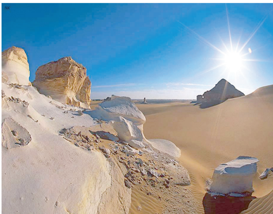
A view at Egypt's White Desert.