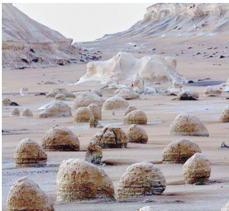
A view of some rocks at the White Desert.