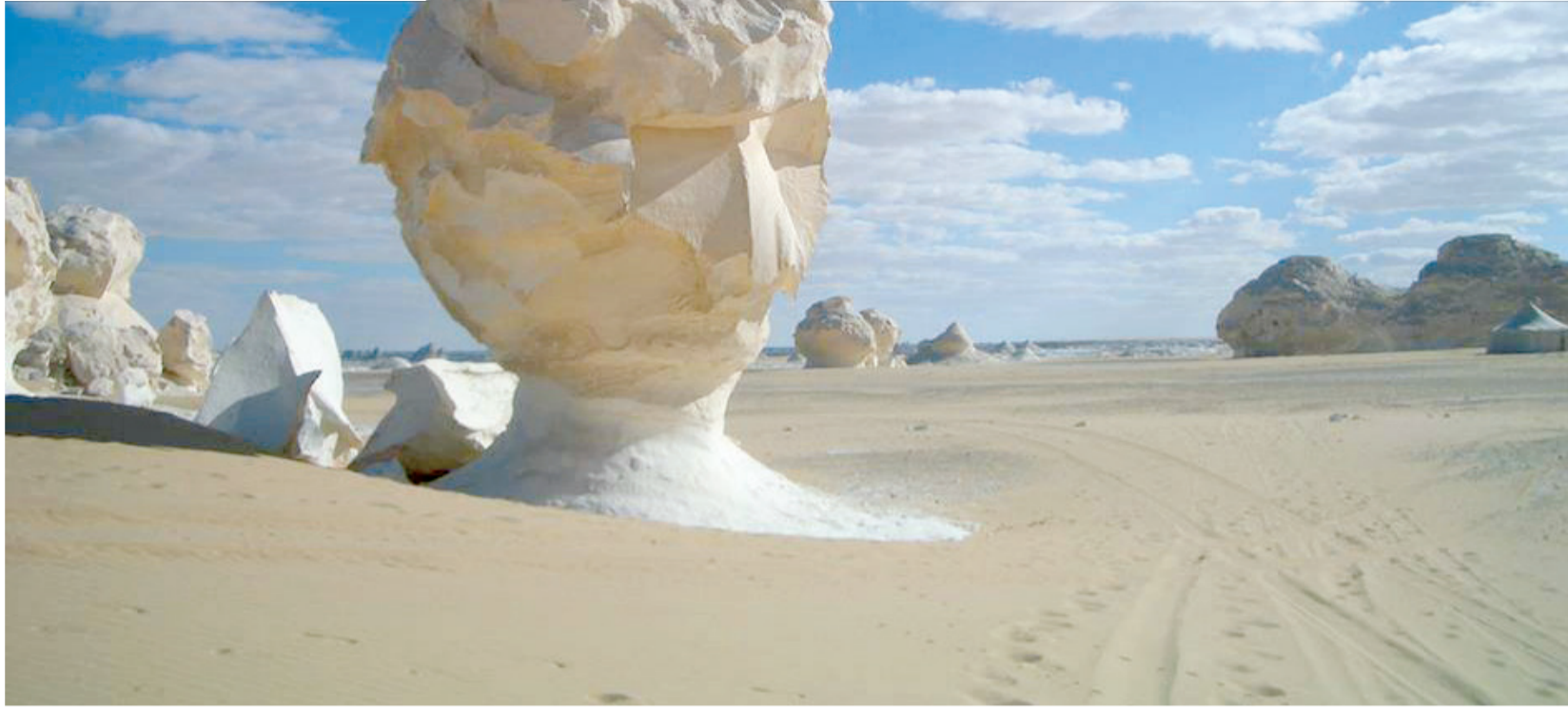
A mushroom rock formation in the White Desert.